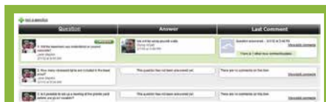
▲ The questions list saves all of your questions, and your builder's answers, in one, easy-to-find place.

You can access the website at any time, but if there is something updated that you need to see on the site, you will also receive an e-mail each morning letting you know.